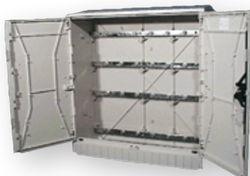
Cable distribution box with Cu-busbars