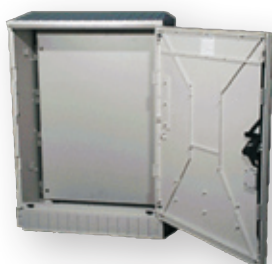
Cable distribution box-empty